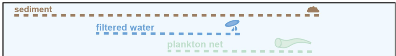
FIGURE 1 (a) Types of environmental DNA (organismal and extra-organismal, including extracellular) with possible sources and approximate size ranges. (b) Illustrative examples of sampling methods with intended captured particle size ranges

of sampling; as such, this type of eDNA is typically of high quality and significant quantity. In contrast, extra-organismal DNA originates from a variety of sources and thus is of highly variable quality and quantity. For example, extra-organismal DNA can come: (i) from biological material shed from an organism as part of tissue replacement or metabolic waste (Allan et al., 2020); (ii) as biologically active propagules such as gametes, pollen, seeds or spores (Stewart, 2019); or (iii) as a result of cell lysis or cell extrusion (Pietramellara et al., 2009). The latter processes results in extracellular DNA, which can persist in the environment on its own or be adsorbed onto surface-reactive particles such as humic substances, clay, silt or sand (Levy-Booth et al., 2007; Pietramellara et al., 2009). Environmental DNA samples are therefore composed of a complex mixture of both types of DNA (i.e., organismal and extra-organismal) from various sources and in varying proportions (Taberlet et al., 2012).