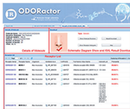
Figure 3. ODORactor results that demonstrate probabilities for interaction between an organic molecule queried (using the SMILES input format) and mouse ORs. The figure shows that there are six possible receptors that are likely to bind the organic molecule with probabilities ranging from 85 to 51%. Links to the receptors in GenBank, UniProt and other olfactory databases are also indicated.

The ODORactor server presents novel approaches towards identifying and predicting ORs that might be activated (or inhibited) by small molecule compounds. To accomplish this, two independent models are employed: the first is a classification model for odorants, in which a query (putative odorant) molecule is associated with one or more of over 300 physicochemical descriptors, and used to train a support vector machine (SVM) model. This is followed by another probability-based classification model for receptor recognition, in which both physicochemical descriptors on odorants and PseAAC (pseudo amino acid composition)