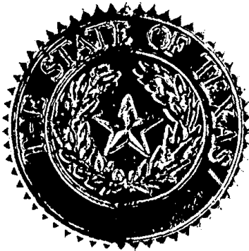
SEAL OF STATE OF TEXAS

A member of the Committee is not entitled to compensation but is entitled to reimbursement for travel expenses (unless otherwise provided by the state employee's agency), as provided for members of state boards and commissions in the General Appropriations Act, incurred in performing duties of the Committee.